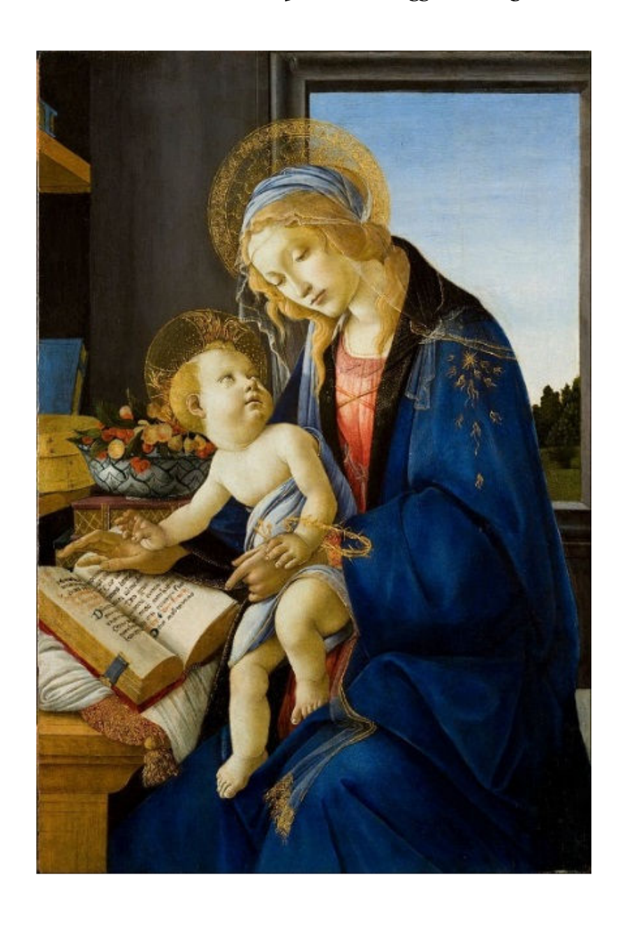
December 24, 2017 ~ 10:00 a.m. Fourth Sunday of Advent Christmas Eve

Established 1727 ~ An Open and Affirming Community