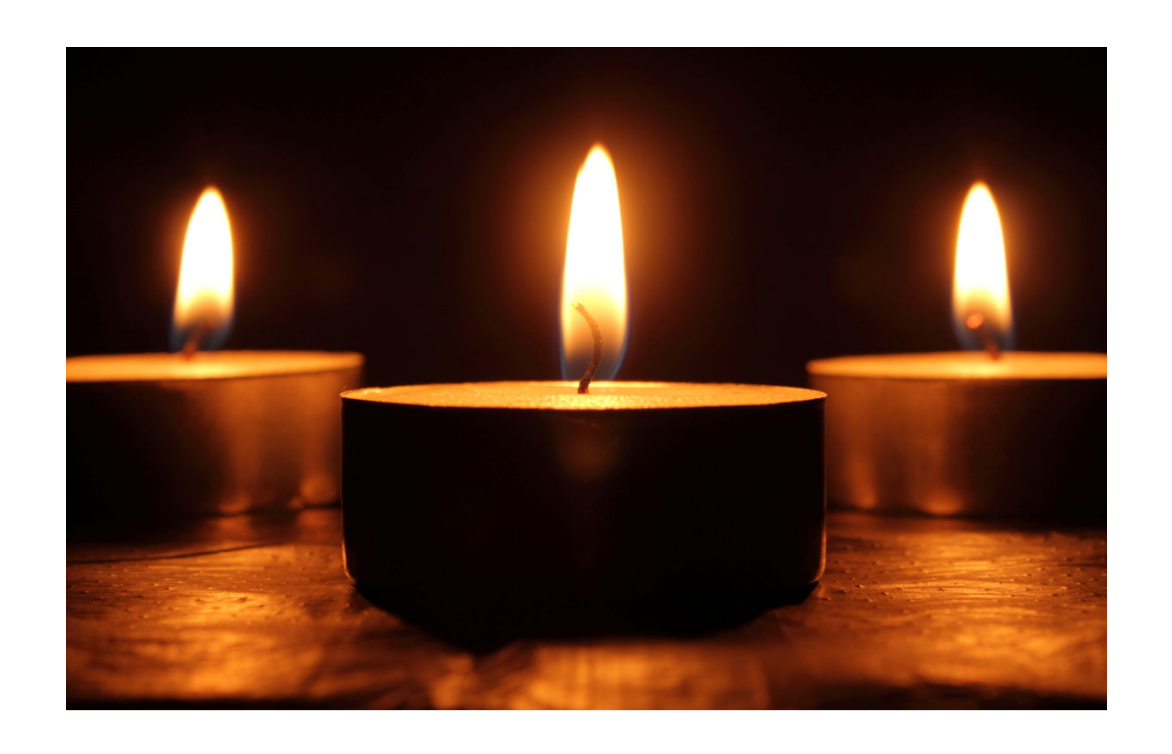
December 17, 2017 ~ 10:00 a.m. Third Sunday of Advent

Established 1727 ~ An Open and Affirming Community