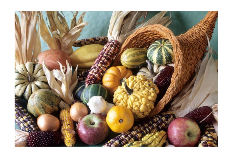
November 24, 2019 \sim 10:00 a.m. Twenty-Fourth Sunday after Pentecost Baptism

Established 1727 ~ An Open and Affirming Community