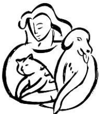
BLESSING OF ANIMALS