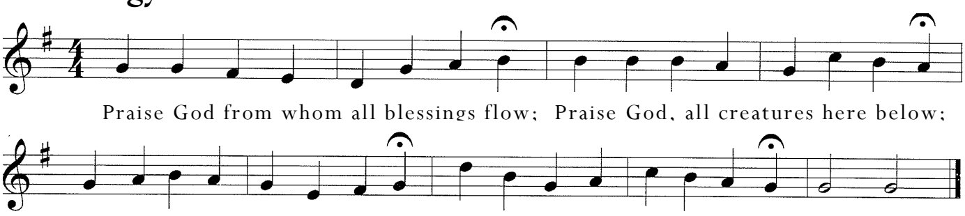
Praise God for all that love has done; Creator, Christ, and Spirit, One. Amen