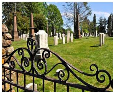
Center Cemetery, Bradford Gate

Join us for a story telling adventure about Rocky Hill history.