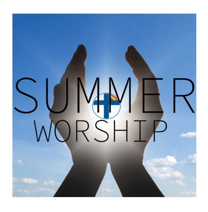
July 14, 2019 ~ 10:00 a.m. Fifth Sunday after Pentecost

Established 1727 \sim An Open and Affirming Community