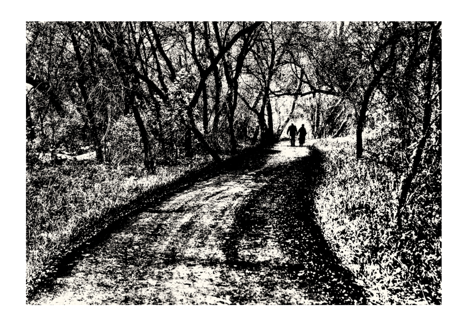
July 12, 2015 ~ 10:00 a.m. Seventh Sunday after Pentecost

Established 1727 ~ An Open and Affirming Community