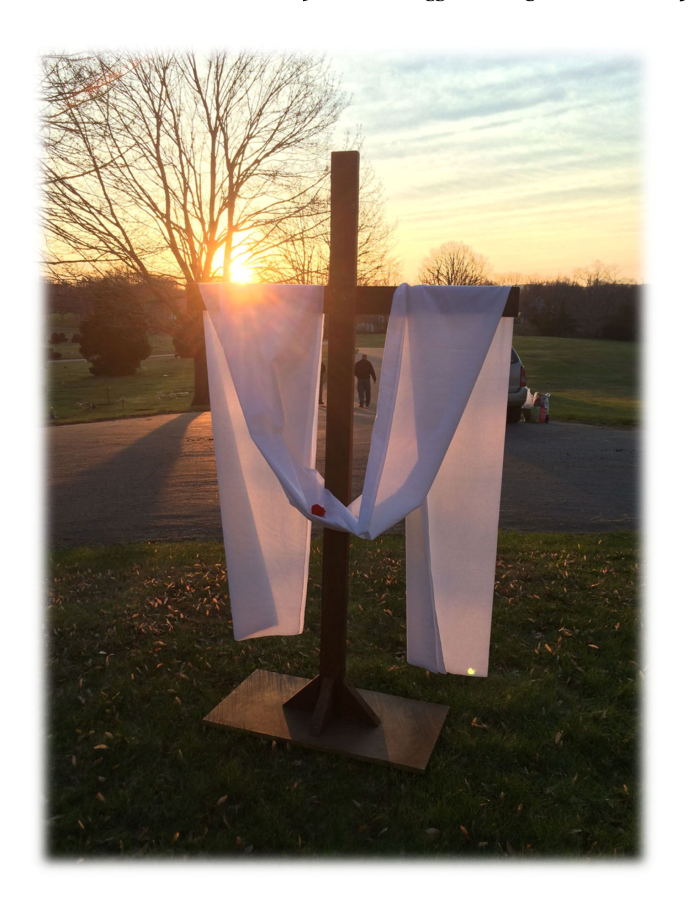
~Easter Sunrise Service~ April 1, 2018

Established 1727 \sim An Open and Affirming Community