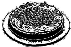
Fat Sunday Bake Sale